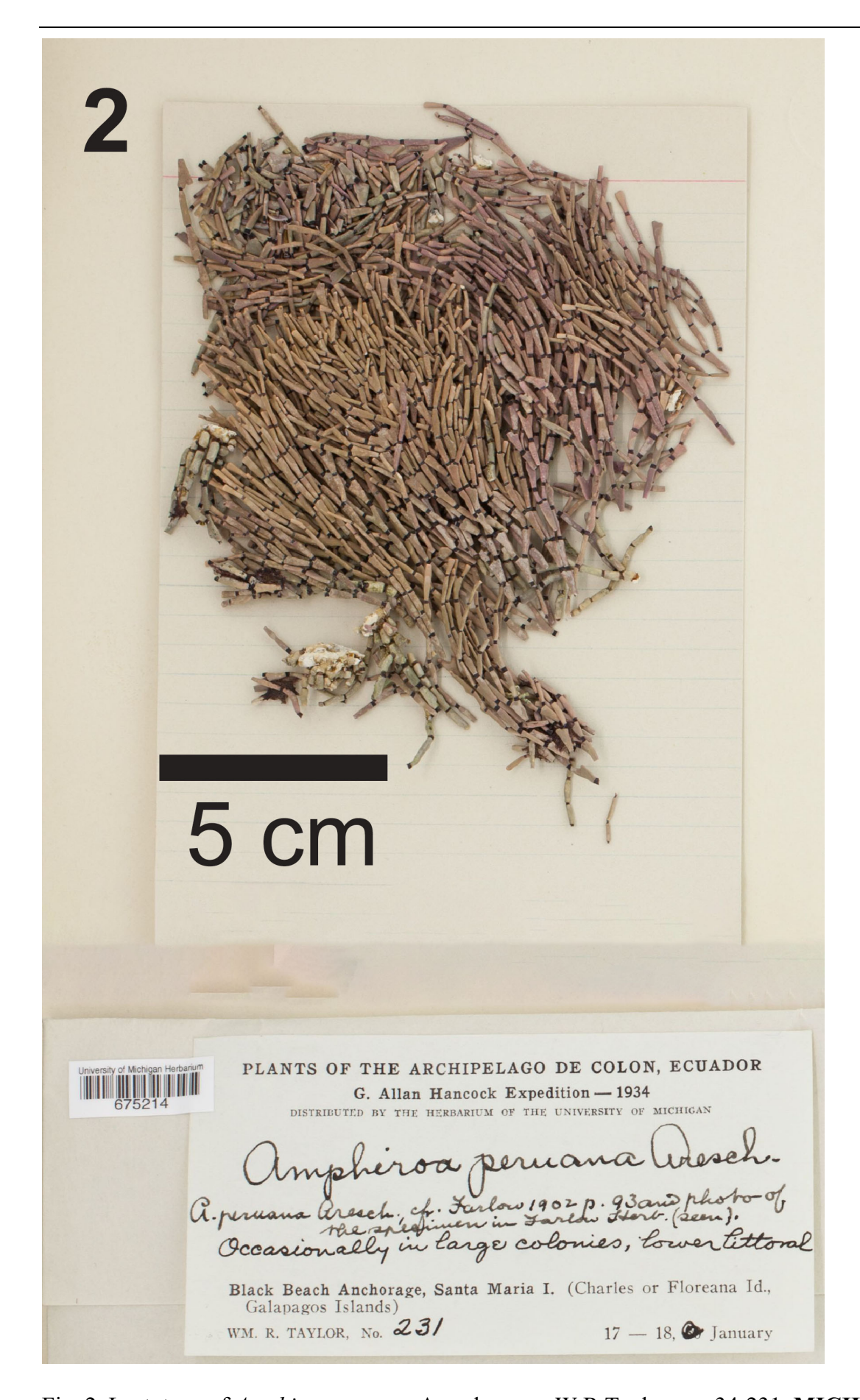
Fig. 2. Lectotype of Amphiroa peruana Areschoug ex W.R.Taylor. no. 34-231. MICH 675214.